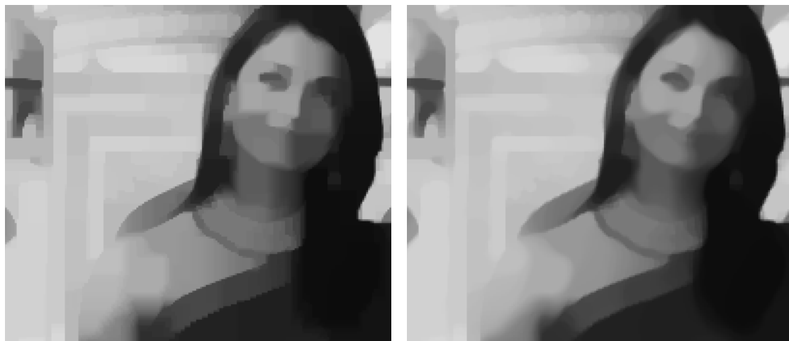
(a) p = 1, \lambda = 5