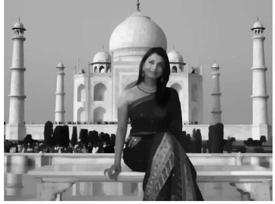
(b) \lambda = 10