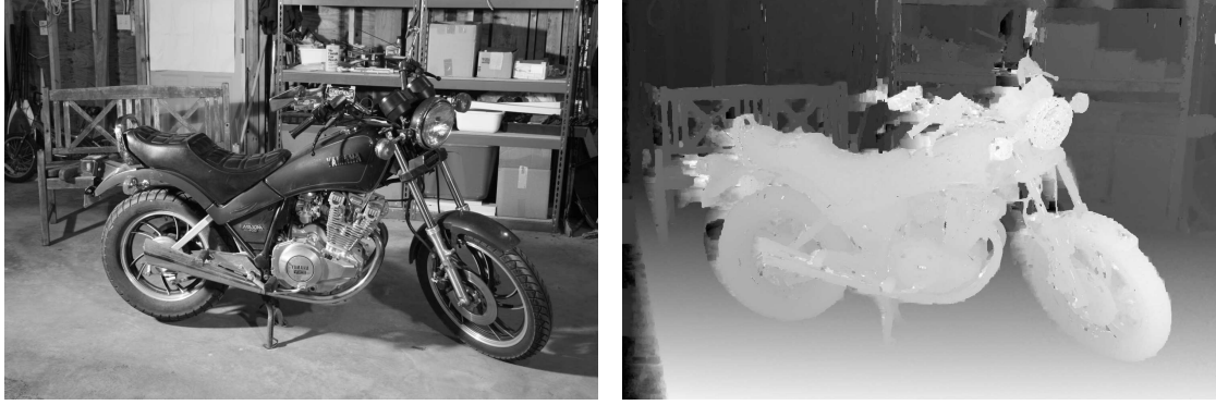
(a) Left image