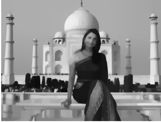
(c) \lambda = 5