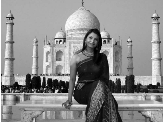
(a) Original image ( 600 \times 800 )