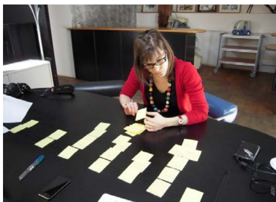
Figure 2. Sorting of concept words, phase 1.

The experimentation was audio-recorded. The post-it sortings were photographed and reprocessed into Excel sheets. Based on the initial groups sorted by the participants, the two interviewing researchers and a third colleague unified the sortings into 18 categories. Each researcher would make a proposal for the categorization and for those with diverging opinions the decision was taken in group agreement and with consideration of the participant's discourse. Once all the words had been assigned to a dimension, statistical data on the word occurrence per dimension and per profession was available.