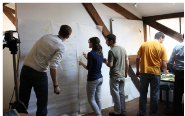
Figure 3. Collective mind mapping, phase 2.

Following the individual conception, all participants (per company) post-its were united in a word pool and sorted by three researchers together into the dimensions of phase one. To sort ambiguous words (e.g. orange – as a colour or an analogy), the context from the simultaneous verbalizations was taken into account. The participants gathered and each was given a marker of a different colour. They had 45 minutes to pick words from the pool, position them on a wall surface, and mark relations of the newly placed words with already