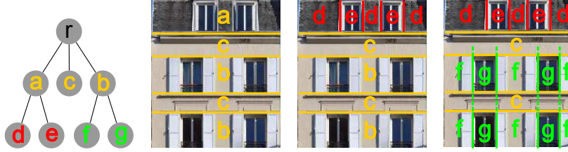
Fig. 1. A shape prior consists of a hierarchy of classes (image 1) and a table of pairwise potentials for each nonterminal node (not shown here). Each image (2-4) shows substitution of all rectangles of a particular class with rectangles of child classes.