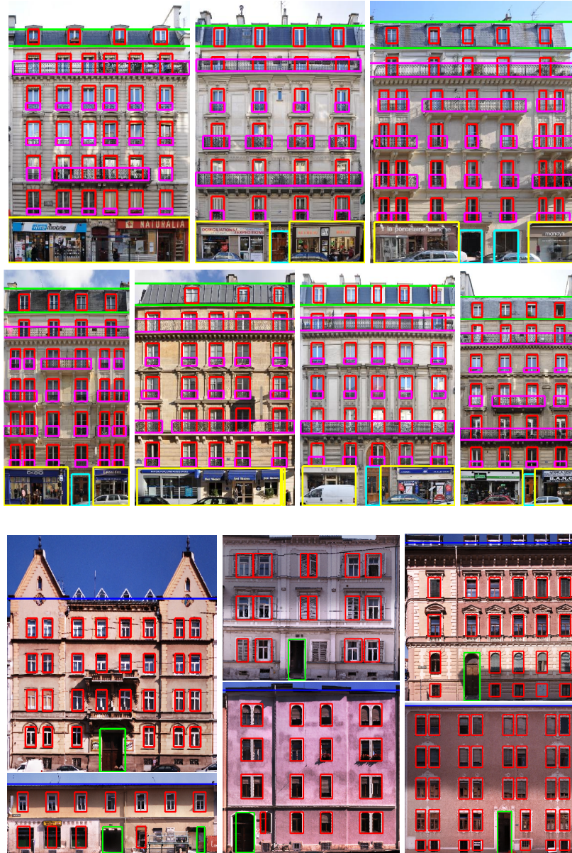
Fig. 4. Example parsing results on the ECP dataset (top) and on the Graz50 dataset (bottom). Green lines separate sky from roof and roof from facade. Balconies are outlined in magenta, shops in yellow, and doors in cyan. Note the variety of alignment patterns supported by the algorithm (top right). Typical errors are missed doors and missed roof windows.