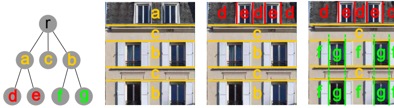
Fig. 1. A shape prior consists of a hierarchy of classes (image 1) and a table of pairwise potentials for each nonterminal node (not shown here). Each image (2-4) shows substitution of all rectangles of a particular class with rectangles of child classes.