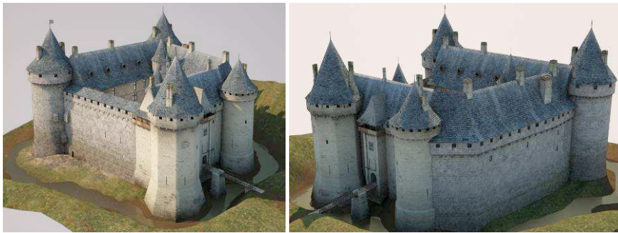
Fig. 3. 3D renderings showing northern and western parts surrounded by ground and moat

In order to produce a mesh of the surrounding castle grounds inclusive in particular of the the moat, two solutions had been considered: to build a mesh from the point cloud resulting from laser scanning or directly use a mesh from a ten years old topographic survey. This last solution was adopted because the mesh is not very dense and untouched by any intrusive vegetation. It was thus easy to handle and it required just a simple vector smoothing to obtain satisfactory results. This topographic survey was conducted in 2005 by civil engineering students and was commissioned by an archaeologist. Two total stations Leica TC1100 and TC705 were used for the survey; isometric curves and a mesh were generated using the Covadis software and were easily imported through 3DSmax with great assistance of the model's .dwg file format.