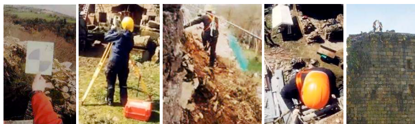
Fig. 2. 3D scanning of the castle

Initially, the process of 3D scanning the castle of Coatfrec was motivated by two specific goals: to prohibit further degradation of the monument, as well as to assist the association responsible for the preservation of the site by providing a more complete reconstruction of its parts. Therefore a team constituted of archaeologists, professional climbers and surveyors from German companies ("Laserscan Berlin", "denkmal3D", Vechta, "Moscito Seiltechnik", Heidelberg and "Rope Access Solutions", Bremen) came twice to France. In 2007, a team covered 90% of the site with the scanner in ten days. The last 10% was measured in 2012 and included mural crowns, parts of the tower, the crenellation and the cistern, which is over 12 m deep (fig 2). The laser scanner used in 2012 could measure 500,000 points per second, its range of accuracy was within a few millimeters with a maximum range of around 79m. After scanning, generated pictures were added to the existing point cloud in order to create a photo-realistic 3D model on which each stone and other details might be viewed at close range. This point cloud further assisted in producing a map of the current state of the ruins. The greatest challenges to the process proved to be the weight of the scanner at 15kg, rain, and overgrowth. But thanks to the assistance of the association of the castle of Coatfrec, the project was a success [4].