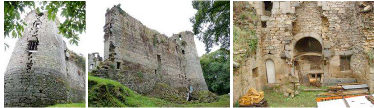
Fig. 1. Photos of the ruins: eastern tower, southern wall and the "Grand Logis"

is connected by the north to the gatehouse, dating from the late 14 th or early 15 th century, by a complex of walls which shows signs of numerous modifications. To the east, a wall dated after 1462 connects to a residential tower with the gatehouse to its north. This wall exhibits three crenellations with loopholes and wooden beams below them assigned to a parapet walk. Each of these elements indicates that aggressors had a relatively limited point of contact.