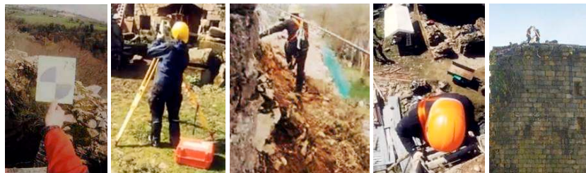
Fig. 2. 3D scanning of the castle

Initially, the process of 3D scanning the castle of Coatfrec was motivated by two specific goals: to prohibit further degradation of the monument, as well as to assist the association responsible for the preservation of the site by providing a more complete reconstruction of its parts. Therefore a team constituted of archaeologists, professional climbers and surveyors from German companies ("Laserscan Berlin", "denkmal3D", Vechta, "Moscito Seiltechnik", Heidelberg and "Rope Access Solutions", Bremen) came twice to France. In 2007, a team covered 90% of the site with the scanner in ten days. The last 10% was measured in 2012 and included mural crowns, parts of the tower, the crenellation and the cistern, which is over 12 m deep (fig 2). The laser scanner used in 2012 could measure 500,000 points per second, its range of accuracy was within a few millimeters with a maximum range of around 79m. After scanning, generated pictures were added to the existing point cloud in order to create a photo-realistic 3D model on which each stone and other details might be viewed at close range. This point cloud further assisted in producing a map of the current state of the ruins. The greatest challenges to the process proved to be the weight of the scanner at 15kg, rain, and overgrowth. But thanks to the assistance of the association of the castle of Coatfrec, the project was a success [4].