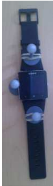
Figure 3. Smartwatch with infra-red markers

By skimming over the map with the smartwatch, users gain access to the names of the different zones as well as the number of POIs that they contain. We partitioned the map in twelve areas (Figure 2). These zones were arranged in a 3x4 grid, which was inspired by Kane's Neighborhood Browsing [5] with the difference of the grid being rectangular in our case. We suggest that this layout is easy to memorize because it corresponds to a T12 layout of a mobile phone keyboard. Indeed it has been observed, that visually impaired users appreciate the use of well-known keyboard layouts [6]. In our map, each zone could hold one or several POIs.