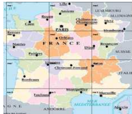
Figure 2. Map of France partitioned in 12 areas arranged in a 3x4 grid as in our prototype.

When moving the watch over an area, the number of POI that it contains is announced. In addition, POIs contained in this area are sent to the smartwatch. A