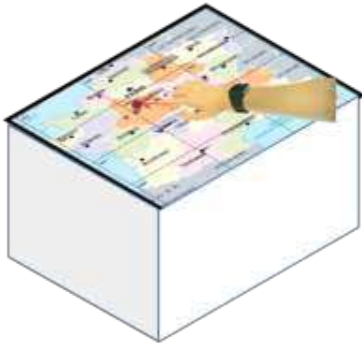
Figure1. Illustration of the 2-step process: Quick-Glance exploration followed by In-Depth guidance.

interests (POI) and streets by executing finger taps. Kane et al. [5] proposed three techniques for assisting visually impaired users' map exploration on a large tabletop: "Edge projection" (projection of the POIs onto the vertical and horizontal edges of the map), "Neighborhood Browsing" (separation of the map into several areas containing exactly one POI), and "Touch and Speak" (verbal directions from the current touch location to the POI).