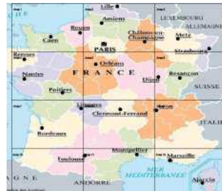
Figure 2. Map of France partitioned in 12 areas arranged in a 3x4 grid as in our prototype.

When moving the watch over an area, the number of POI that it contains is announced. In addition, POIs contained in this area are sent to the smartwatch. A