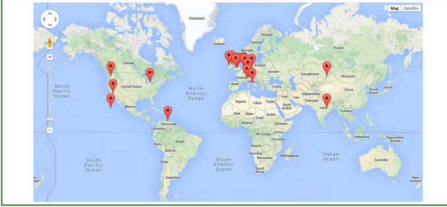
Fig. 3: Snapshots for Query 1 execution. During the demonstration all the reported results will be computed on-the-fly.