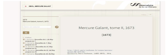
Figure 3 The Memory Islands for the Le Mercure Galant journals. The top image show the islands for all the documents in the website of OBVIL and we can access to the