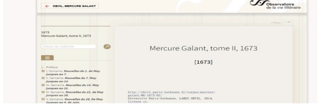
Figure 3 The Memory Islands for the Le Mercure Galant journals. The top image show the islands for all the documents in the website of OBVIL and we can access to the