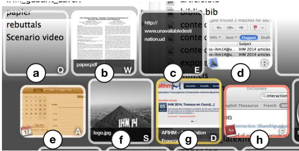
Figure 4. Closeup on the top left keys of the Hotkey Palette above the active window: (a) empty key; (b) document preview; (c) document title when the preview is not available; (d) window preview; (e) yellowed preview of a closed window; (f) grayed preview of a deleted document; (g) contextual shortcut associated to the active window (yellow border); (h) contextual shortcut associated to an ancestor of the document shown in the active window.

sibility API to inspect objects under the mouse, as well as to get specific information on the contents of a window, such as the document it represents. We also used the bookmarks API to make shortcuts resilient to renamed or moved documents, ensuring that they can always be opened, and the previews of local documents and remote web pages are generated using the Quick Look API and WebKit, respectively.