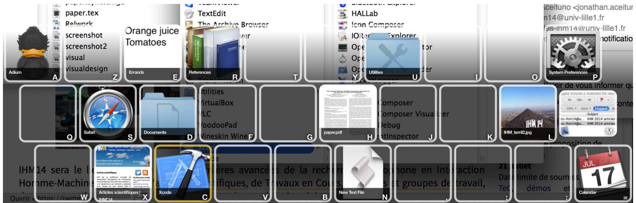
Figure 1. Hotkey Palette displayed on the bottom of the display, on top of other windows.