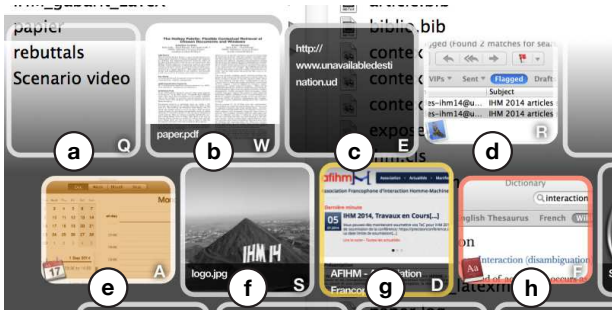
Figure 4. Closeup on the top left keys of the Hotkey Palette above the active window: (a) empty key; (b) document preview; (c) document title when the preview is not available; (d) window preview; (e) yellowed preview of a closed window; (f) grayed preview of a deleted document; (g) contextual shortcut associated to the active window (yellow border); (h) contextual shortcut associated to an ancestor of the document shown in the active window.

sibility API to inspect objects under the mouse, as well as to get specific information on the contents of a window, such as the document it represents. We also used the bookmarks API to make shortcuts resilient to renamed or moved documents, ensuring that they can always be opened, and the previews of local documents and remote web pages are generated using the Quick Look API and WebKit, respectively.