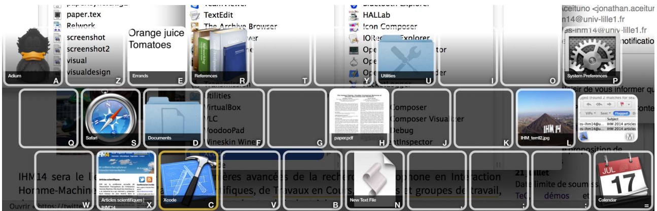
Figure 1. Hotkey Palette displayed on the bottom of the display, on top of other windows.