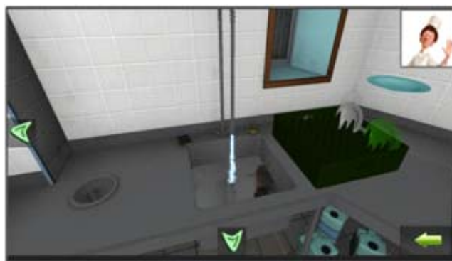
Figure 3. Putting away of the rinsed dishes into baskets.

Beyond these tasks, the tool enables the user to visit the kitchens in a first person perspective and to watch several educational videos related with the tasks of dishwashing (i.e., to rinse the plates). First person view means that the visual sight angle simulates the vision field of the user.