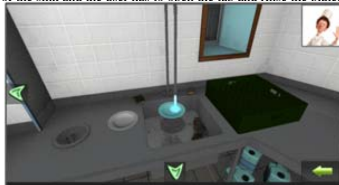
Figure 2. Rinsing out of the dirty dishes.

The second task corresponds to the rinsing out of the dirty dishes, especially plates. Concretely, dirty plates are placed on the right of the sink and the user has to open the tap and rinse the plates.