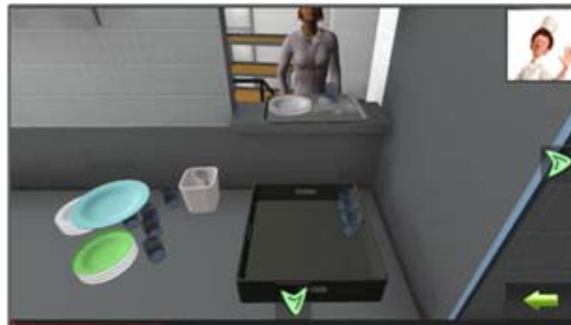
Figure 1. Reception of dirty dishes.

The first task is to receive the dirty dishes (plates, glasses and cutlery). Specifically, the user begins by choosing the correct basket for the task. Then the dishes are brought by an avatar: the user has to pile up the plates, store glasses in the basket, place the cutlery in a small basket and then place this small basket in the large one.