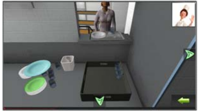
Figure 1. Reception of dirty dishes.

The first task is to receive the dirty dishes (plates, glasses and cutlery). Specifically, the user begins by choosing the correct basket for the task. Then the dishes are brought by an avatar: the user has to pile up the plates, store glasses in the basket, place the cutlery in a small basket and then place this small basket in the large one.