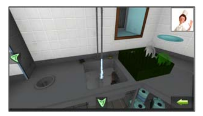
Figure 3. Putting away of the rinsed dishes into baskets.

Beyond these tasks, the tool enables the user to visit the kitchens in a first person perspective and to watch several educational videos related with the tasks of dishwashing (i.e., to rinse the plates). First person view means that the visual sight angle simulates the vision field of the user.