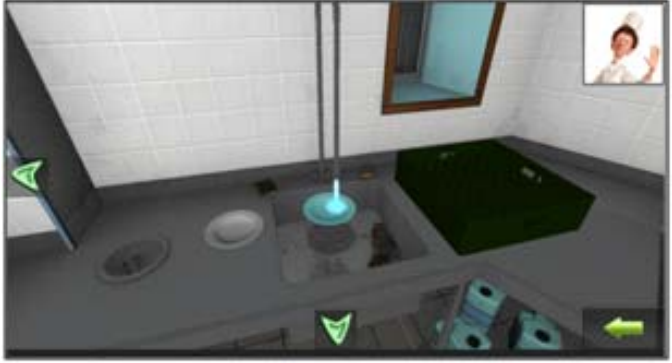
Figure 2. Rinsing out of the dirty dishes.

The second task corresponds to the rinsing out of the dirty dishes, especially plates. Concretely, dirty plates are placed on the right of the sink and the user has to open the tap and rinse the plates.