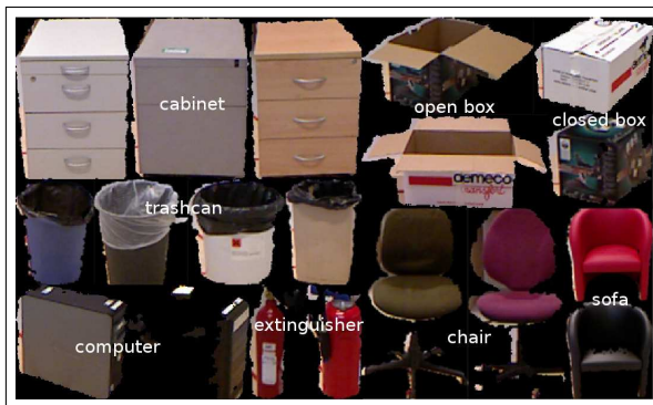
Fig. 2. Examples of cropped images of 19 objects from the offline database. Segmentation errors and sensor imperfections can be seen on the left hand side computer and the red office chair.

We compiled a database of RGB-D images (and data from other robot sensors) of 52 objects, shot from 6 viewing angles. The data was collected by a robot as it autonomously moved back and forth in front of the objects. For each angle of view, 100 snapshots were taken from a distance varying between 1 and 4 meters. The objects lay on the floor, in open space. Because the robot moves during data acquisition, shifts sometimes occur between the color and the depth image and some shots are partial views of an object. As these conditions reflect the situation in which the algorithms will be tested, imperfect data were kept in the database. Only shots where the object does not appear were manually removed. The RGB-D images were processed by our segmentation algorithm, described in section 4.1, to produce appropriate data for the object recognition algorithm. This data is referred to as offline data. It was acquired with the room lights on and the windows blinds closed, during summer time. An example image of 19 objects of the database are shown in figure 2.