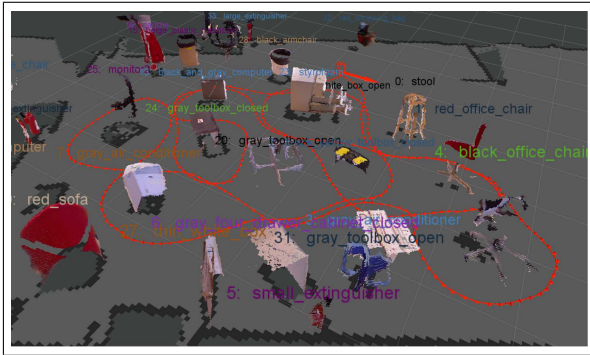
Fig. 1. The semantic map resulting from the online experiment.