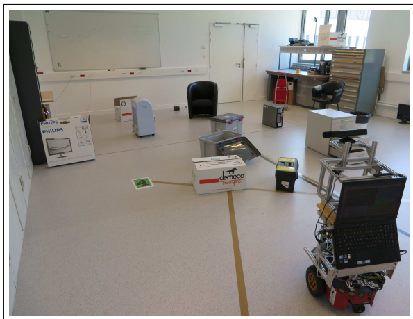
Fig. 3. The room in which the online experiment is conducted, with some of the objects from the offline database.

from each other. The same robot that was used for building the database was, this time, manually controlled to wander around among the objects at the same time as it executed diverse tasks. These tasks are simultaneous localization and mapping, scene segmentation of the RGB-D image, object recognition of the segments, and display of the resulting semantic map (a map containing the objects found and their label). This experiment was conducted in the same room where the offline database was collected, but in a different part of the room, see figure 3. The lights were on, the window blinds open, and it was winter. This database contains a total of 135 segmented objects, with at least one occurrence of an object from 18 object instances from the offline database (due to some segmentation errors, some of the 22 selected objects are never seen). Figure 4 shows some examples of the difficulties encountered in this experiment.