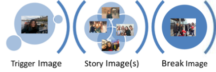
Fig. 3. Illustration of an event board

F : is a set of features characterizing the group of users, locations and times in the event. It is represented as: