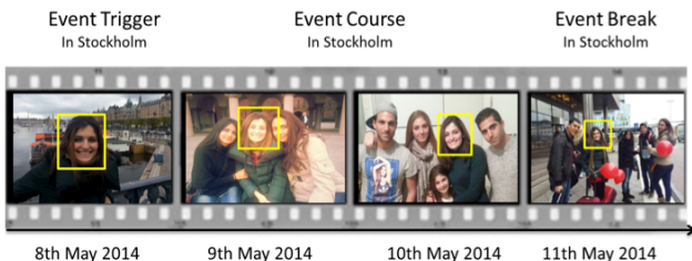
Fig. 1. Some photos of u_0 taken in Stockholm over the four days of the trip showing her colleagues (2 nd and 4 th photo) and her old friends (3 rd photo)

u_0 has photos in Stockholm over the four days (Fig. 1).