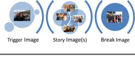
Fig. 3. Illustration of an event board

F : is a set of features characterizing the group of users, locations and times in the event. It is represented as: