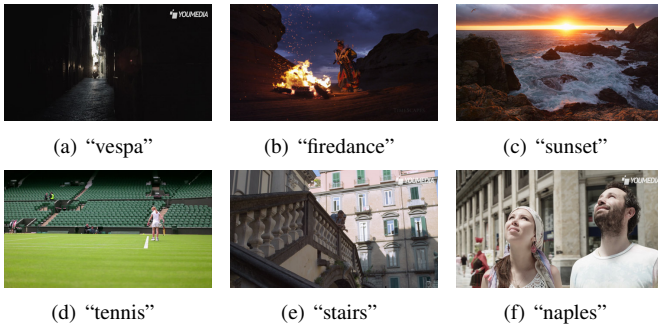
Fig. 1. Sample frames from the six test sequences used for the test.

regions are expanded linearly up to a fraction \rho of the available HDR display luminance. The remaining 1 - \rho fraction of the display range is then linearly allocated to the specular regions. Didyk et al. [7] employed a multi-class approach with learning that requires manual intervention from the user. The method in [6] requires heavy manual intervention, too. A more general approach is the local class, in which the expansion is localized by employing a pixel-wise expand map , which describes the amount of expansion to be applied to each pixel. This approach was proposed in different works [2, 3, 8].