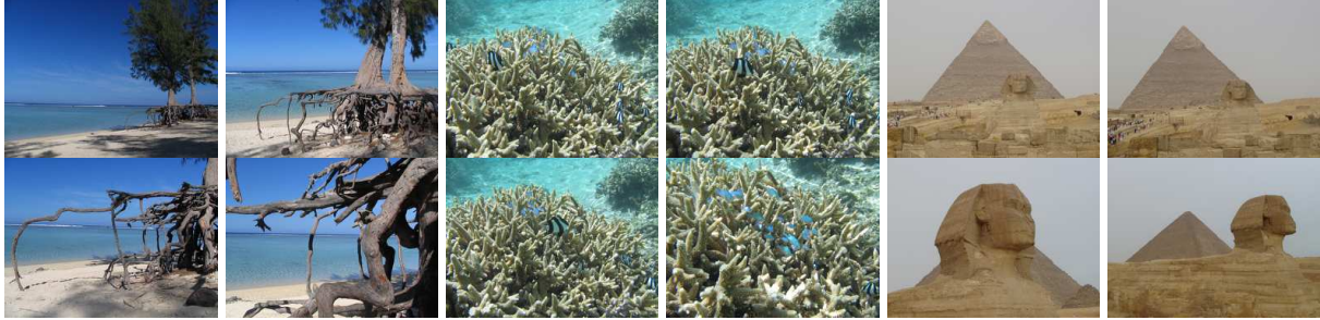
Fig. 1. Images from Holidays dataset [11].

dataset as function of the computational cost of our dimensionality reduction method. This cost is induced by the two projection steps: the projection of the signature on the sparse projectors; and the projection on the correction matrix. The continuous and dashed curves represent the performance of the reduced signatures with and without the correction step respectively. We note that at equivalent computation cost, the high dimensional projectors are less sensitive to high sparsity rate. We see that the correction step allows to correct well the errors introduced by sparse projectors. Moreover, we observe that the higher the sparsity rate, the more effective the correction step. We also observe that the mAP performance is similar for any type of signatures. Thus, our method is not sensitive to a particular signature choice. For instance, with “CSR-FV-256” signature and a sparsity rate of 90%, the computational cost is divided by a factor of about 9 without any performance loss. With the same “CSR-VLAT-256” signature, but with a sparsity rate of 99.9%, the computational cost is divided by a factor of about 1000 while incurring a mAP loss of only 0.9.