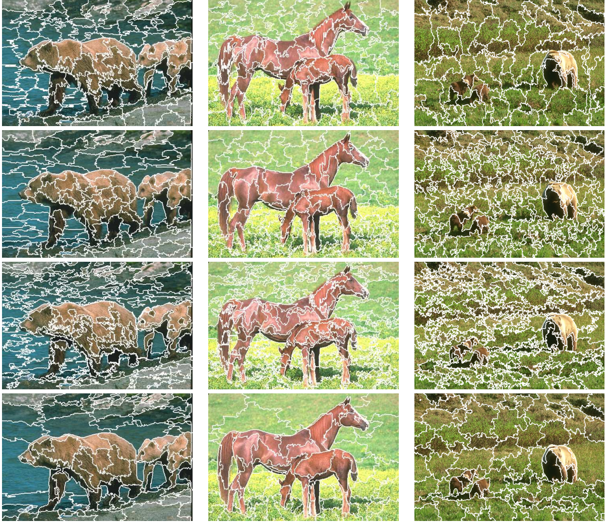
Fig. 4. Visual comparison between algorithms with 100 clusters per oversegmentation. From top to bottom: SLIC [10], ERS [11], SEEDS [12], and our algorithm. Important leaks for SLIC, ERS and SEEDS can be seen on the muzzle of the bear (left column), on the horse’s mane or on the belly foal (middle column), and on the bear cubs (right column). High Contour Coverage of SEEDS is also highlighted (third row).