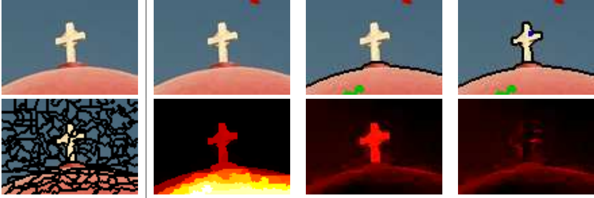
Fig. 2. Illustration of our automatic seeds positioning scheme on graph. First column: the image and the initial dense oversegmentation. Then from left to right, 3 seeds are added iteratively on the RAG (depicted in red, green and blue respectively), and the corresponding geodesic distance map are shown with a heat color map.

tion that contains far much less vertices than the number of pixels of the image. The feature vector F_v attached to a vertex v corresponding to a region C_i is the mean color (in the Lab colorspace) of this region. As for the 4-grid graph, the \mathcal{L}_2 norm is used to weight the edges of the RAG. Throughout the experiments, the stopping criterion of the iterative process is simply the desired number of final clusters in order to provide fair comparisons with other oversegmentation algorithms with equal number of clusters.