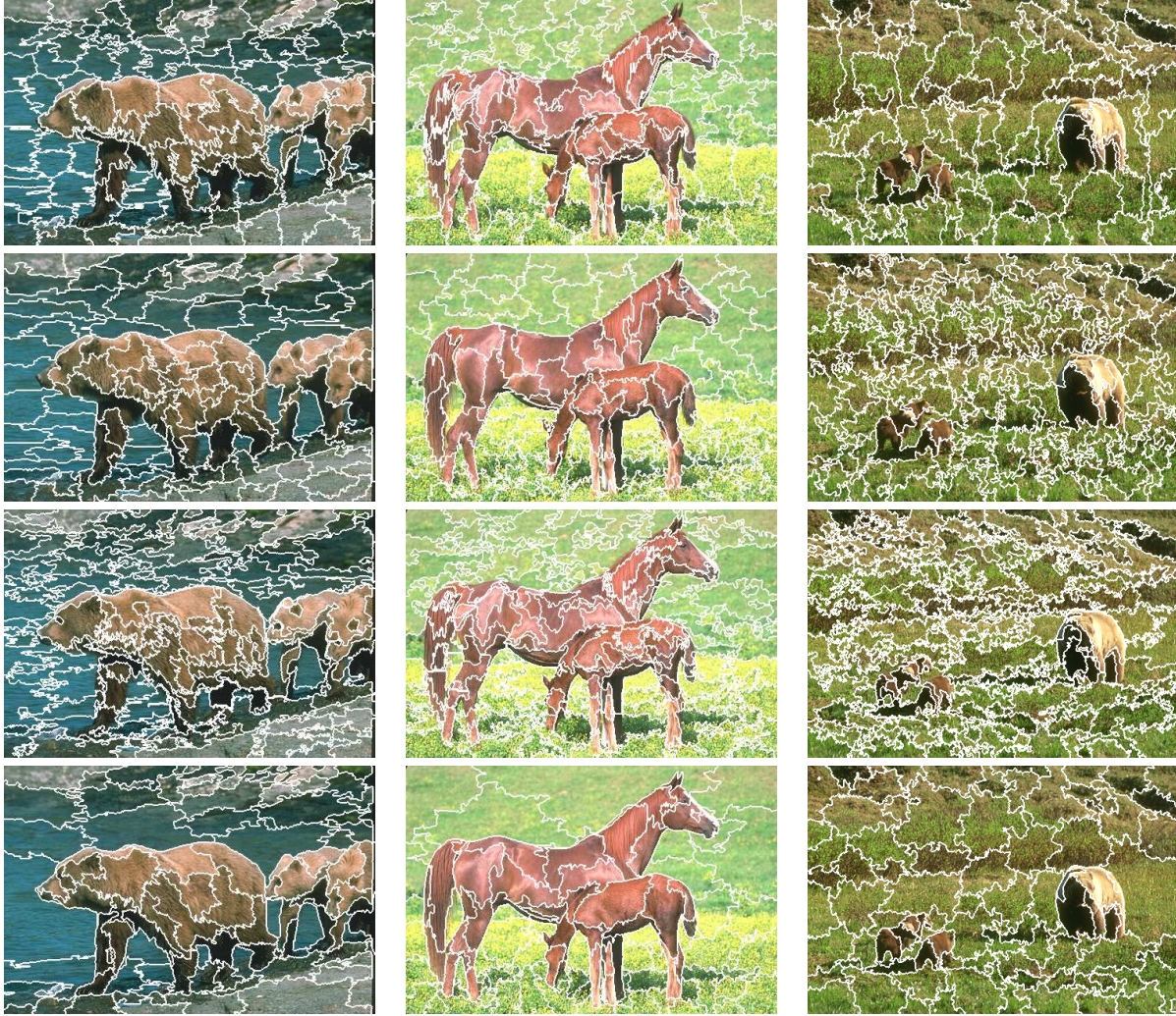
Fig. 4. Visual comparison between algorithms with 100 clusters per oversegmentation. From top to bottom: SLIC [10], ERS [11], SEEDS [12], and our algorithm. Important leaks for SLIC, ERS and SEEDS can be seen on the muzzle of the bear (left column), on the horse’s mane or on the belly foal (middle column), and on the bear cubs (right column). High Contour Coverage of SEEDS is also highlighted (third row).

• Achievable Segmentation Accuracy (ASA) is a segmentation upperbound measure that gives the best segmentation accuracy that can be obtained by using the clusters as units: