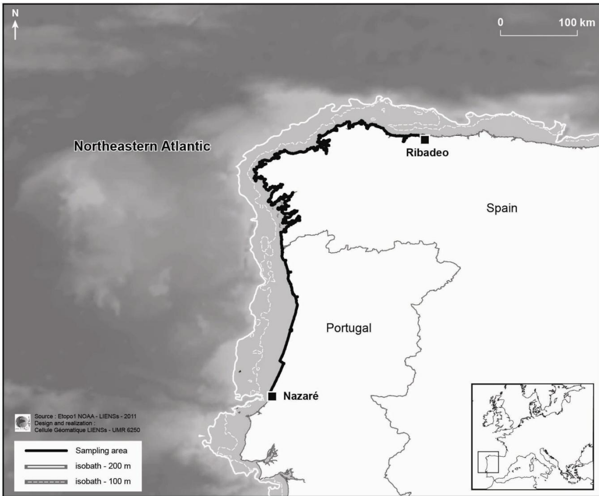
Fig 1. Map of the study area including the 100 and 200 m isobaths. The 200 m isobath was taken as the limit for the shelf-break. The black line contouring the coast represents the length of the coastline which constituted the sampling area.