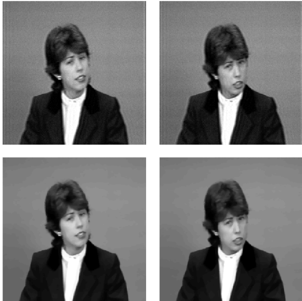
Fig. 1. 3rd and 12th frames of the Claire sequence: Noisy convolved images, SNR = 25.6 dB (top) and restored images (bottom) with the proposed algorithm, SNR = 32.2 dB.

regularization strategy, note that, when taking \beta_{\ell,t} \equiv 0 , we observe a decrease of the estimation quality, as the SNR of the restored sequence is equal to 31.2 dB and the kernel estimation error to 0.016.