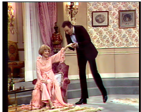
Fig. 3. 2nd frame of the real INA sequence: Degraded image (top) and restored image (bottom) with the proposed algorithm.