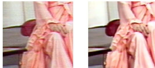
Fig. 4. Zoom on a part of the above images.