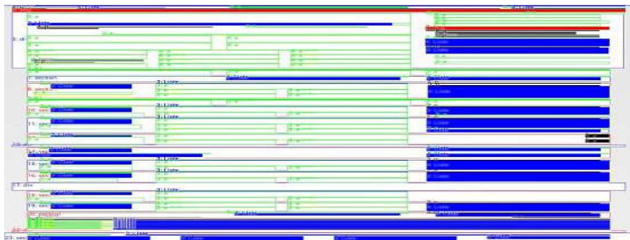
Figure 2. A graphical representation for a page web (leparisien.fr)

To illustrate results of applying previous two mentioned approaches, we represented an obtained filtered DOM-tree on the used tablet. Figure 2 views a graphical representation for a page web, since each rectangle represents a block in the analyzed web page. Red rectangles represent images ( <img> tags), green rectangles represent links ( <a> tags), blue rectangles represent list of items ( <ul> or <ol> tags), and finally, black rectangles represent paragraphs ( <p> tags).