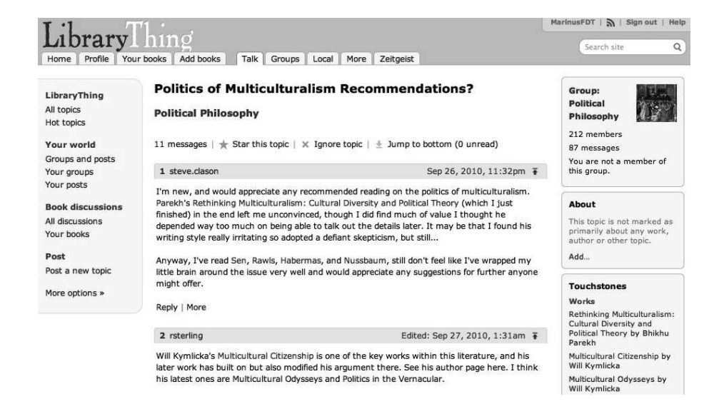
Fig. 1. A topic thread in LibraryThing, with suggested books listed on the right hand side.

valuable judgements on the relevance of books. Additional relevance information can be gleaned from the discussions on the threads. Consider, for example, topic 129939<sup>8</sup>. The topic starter first explains what sort of books he is looking for, and which relevant books he has already read or is reading. Other members post responses with book suggestions. The topic starter posts a reply describing which suggestions he likes and which books he has ordered and plans to read. Later on, after some more discussions, the topic starter provides feedback on the suggested books that he has now read. Such feedback can be used to estimate the relevance of a suggestion to the user.