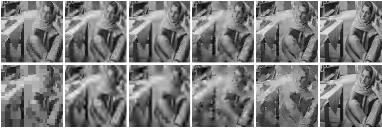
Fig. 1. Reconstruction of “Barbara” image from 1024 (top row) and 256 (bottom row) coefficients. Columns from left to right: Haar, Daubechies 4, CDF(2,2), lifting on unweighted 4-adjacency graph, lifting on 8-adjacency graph, lifting on 25 nearest-neighbors graph with Gaussian weights.