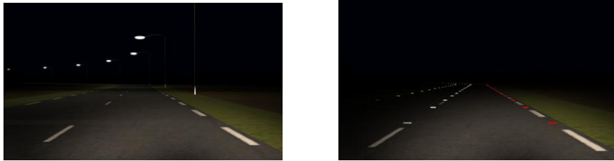
Fig. 4. High Dynamic Range rendering of night-time driving conditions with road lighting (left) and LED studs (right).

Thanks to these improvements in the visual rendering engine of our simulator, we were able to investigate potential applications of intelligent LED road studs at night (see Shahar & Brémond, 2014). The focus of this study was on the visibility, the legibility and in general terms the benefits of such LED-based systems. We used a simulator having three Full-HD 47-inch screens. The central view of the driving simulator (figure 4) was a HDR (High Dynamic Range) screen which provided a luminance range much wider than classical screens (Seetzen et al., 2004). Luminance was measured with a luminance meter and calibrated in order to match the real situation. Moreover, subjective judgements (questionnaires) indicated a good experiential validity. This new functionality of Ifsttar's simulator will allow us investigating night-time driving conditions.