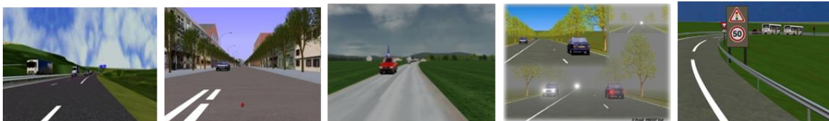
Fig. 2. Sample road configurations and traffic conditions rendered on Ifsttar's driving simulator.

Simulators allow creating virtual environments supported by the technical information which describe the infrastructure (e.g., alignment, cross section). It can be the mock-up of a real environment or that of a future road project. And it is possible to add or modify road features for the purpose of evaluation (figure 2).