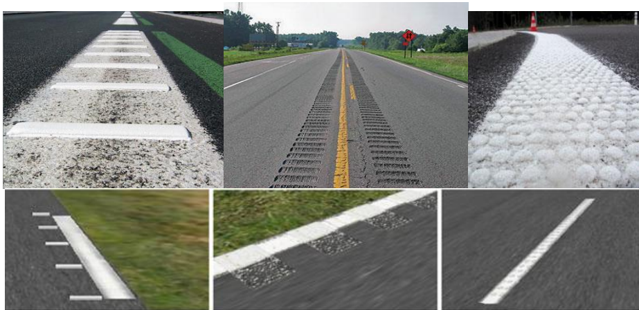
Fig. 3. Illustrations of the audio-tactile systems tested: the first line contains pictures of systems in the real world; the second line shows snapshots of their virtual reconstruction.

The ROADSENSE project aimed at defining and at optimizing the technical characteristics of warning audio-tactile systems (e.g., rumble strips). The purpose of these systems is to prevent run-off-road accidents by warning the drivers with vibrations (Rosey, 2011). Trials were conducted on a driving simulator, on a test track as well as on a road open to traffic in order to rate the performance of different systems (figure 3), and to evaluate drivers' perception. Since audio-tactile markings produce a warning when the tire of the vehicle runs over them, it was necessary to provide visual, vibratory and acoustic feedback to the participants. This called for a new vibro-acoustic rendering module. Rendered vibrations and sounds were measured with accelerometers and microphones and compared to measurements in the field; agreement between these measurements indicated satisfactory physical validity.