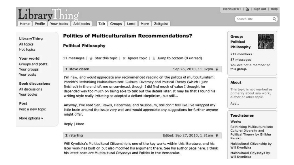
Fig. 1. A topic thread in LibraryThing, with suggested books listed on the right hand side.

the information need if the full-text index found it least one suggestion in the top 1000 results. This left 6510 topics. Next, we used short regular expressions to select messages containing any of a list of phrases like looking for, suggest, recommend . From this set we randomly selected topics and manually selected those topics where the initial message contains an actual request for book recommendations, until we had 89 new topics. We also labeled each selected topic with topic type (requests for books related to subject, author, genre, edition etc.) and genre information ( Fiction, Non-fiction or both).