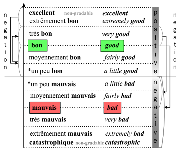
Figure 2: Our model of negation and graduation

Figure 2 describes how negation acts on force and polarity of a word or expression. Our model of negation is inspired by French linguists (Charaudeau (1992), Muller (1991), etc.). We chose to present this model with the opposite pair bon “good” ↔ mauvais “bad”, because the antonymy relation characterizes most gradable words, placing them on a scale of values from a negative extremity to a positive one.