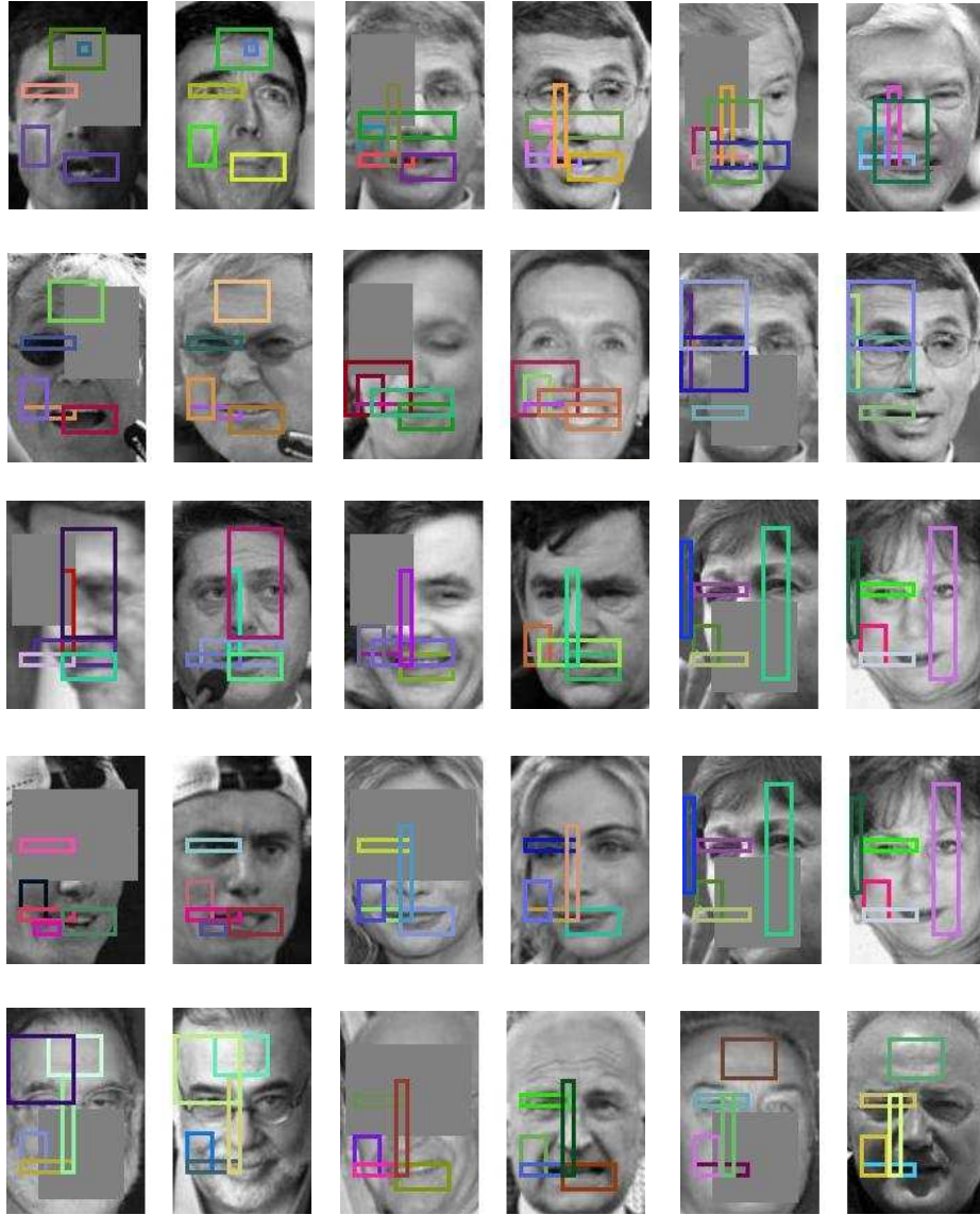
Fig. 5. Visualization of the parts used by the proposed EPML model, for matching pairs of faces in the presence of significant occlusions. The top 5 parts out of 20 (with randomly selected colors for better visibility) selected by the model for scoring the face image pairs are shown. We observe that the method quite successfully ignores the occluded parts. The parts used are also quite diverse and have good coverage as ensured by the model. See §3.2 for discussion.