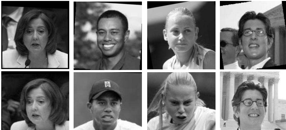
Fig. 2. Example positive image pairs from the LFW [27, 35] dataset.

w.r.t. a single training pair (\mathbf{x}_i, \mathbf{x}_j, y_{ij}) , are given by