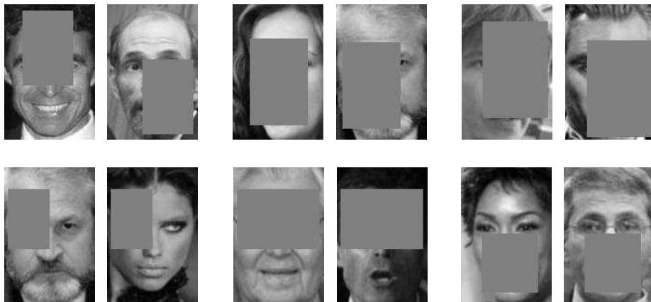
Fig. 3. Examples images showing the kind of occlusions used in the experiments. The top row shows random occlusions while the bottom row shows focussed, and fixed, occlusion of eyes (one, both) and mouth+nose.

face around the nose and the mouth. We then occlude these regions, one at a time and in combinations, by overlaying uniform patches. As with the random occlusions above, we do it for one of the, randomly selected, faces in the pair. We test the system for robustness to occlusion of (i) left/right eye, (ii) both eyes, (iii) central face part around the nose, (iv) mouth and (v) nose and mouth. Fig. 3 (bottom row) shows examples of such occlusions.