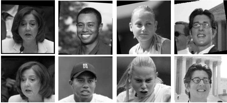
Fig. 2. Example positive image pairs from the LFW [27, 35] dataset.

w.r.t. a single training pair (\mathbf{x}_i, \mathbf{x}_j, y_{ij}) , are given by