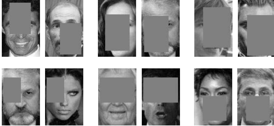
Fig. 3. Examples images showing the kind of occlusions used in the experiments. The top row shows random occlusions while the bottom row shows focussed, and fixed, occlusion of eyes (one, both) and mouth+nose.

face around the nose and the mouth. We then occlude these regions, one at a time and in combinations, by overlaying uniform patches. As with the random occlusions above, we do it for one of the, randomly selected, faces in the pair. We test the system for robustness to occlusion of (i) left/right eye, (ii) both eyes, (iii) central face part around the nose, (iv) mouth and (v) nose and mouth. Fig. 3 (bottom row) shows examples of such occlusions.