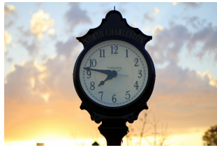
Taken by North Charleston