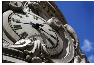
Taken by cobra