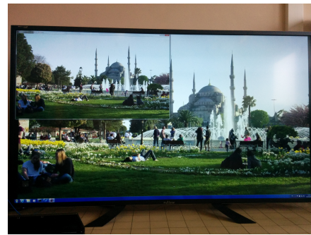
Fig. 2. GPAC player displaying 4K and HD video sequences on a 84 inches 4K TV

The default configuration displays the highest decoded layer. However, the client can switch between the base and the enhancement layers by ctr+l and ctr+h , respectively. Figure 2 illustrates the proposed demonstration displaying both HD (on the left) and 4K video sequence on a 84 inches 4K TV.