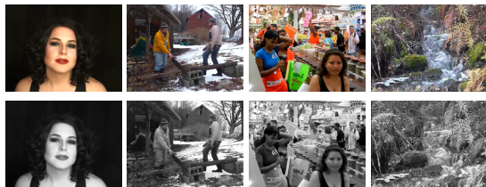
Fig. 3: Example frames in color and grayscale.

In most of studies investigating the influence of color information on eye movements, the grayscale version of stimuli is obtained using NTSC conversion, which is based on the weighted sums of R, G and B channels [11, 12]. However such method is not adapted for specific experimental set up. Here, to ensure the luminance matching between color and grayscale video stimuli, the weights of R, G and B channels in equation 1 were found to fit V(\lambda) of standard observer. The equation was found by directly measuring the luminance reflectance of the three color channels of the experimental set up using a Photo Research PR650 spectrometer. Figure 3 depicts example frames of color and grayscale video snippets.