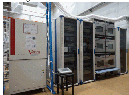
Fig. 2. The experimental setup for accelerated aging tests