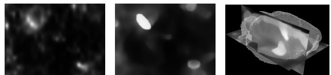
Fig. 3. Real [18F]DPA-714 PET acquisition of a rat brain. left : original image. middle, right : 4DRSF filtering result

We have proposed a new restoration method for vector-valued images that allows to increase the SNR while simultaneously sharpening vector edges. The proposed approach exploits robust sharpening directions derived from a new vector field that takes profit of the entire spatio-spectral information available in order to better identify both edges strength and direction. Results obtained on synthetic images confirm the potentiality of the proposed method for the restoration of 2D color and 3D+t images.