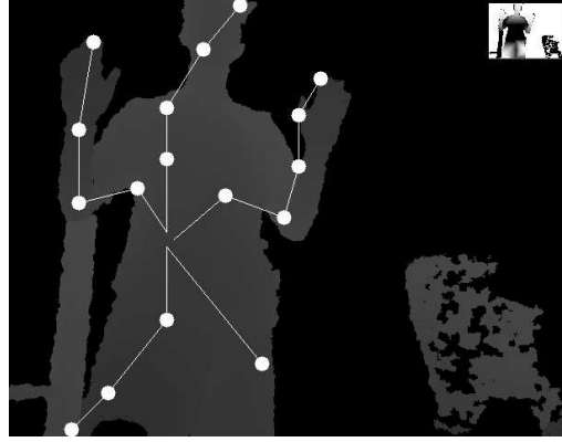
Figure 4. Final result after simplification.