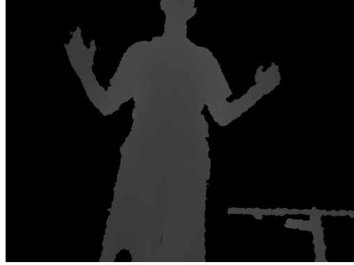
Figure 2. Foreground (user) segmentation.