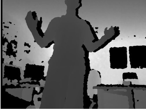
Figure 1. OpenNI source depth-map (normalised).