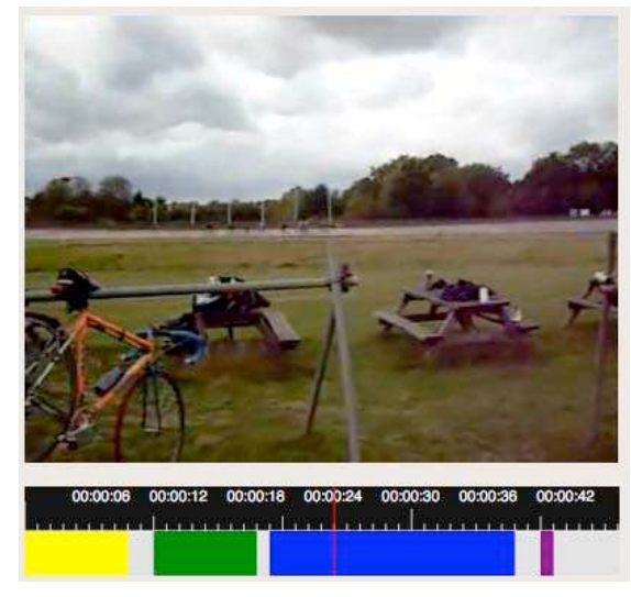
Four periods annotation of a video file

Annotation of videos are quite similar to the annotation of sounds, it's a temporal segment of a video file. A period or a marker annotation of a video file doesn't define a shape in the video stream. This is not in the timeline-js scope to deal with video stream annotation, but it can be define outside, using events (cf. 3.4).