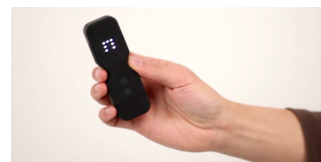
Figure 1: MO: Modular Musical Objects

We use the Modular Musical Objects (MO) for gesture capture [5]. These wireless devices include an accelerometer and a gyroscope, and can be integrated to various objects, or extended with additional sensors, for example piezo-electric sensors.