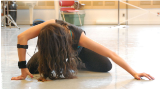
Figure 2. A participant equipped with the sensors: 3D accelerometer (wrist) and EMG (forearm).

Weight Effort Factor: intensity of the muscular activation evaluated using a non-linear Bayesian filtering of Electromyography (EMG), captured with an EMG sensor placed on the right forearm. The muscular tension variation correlate to the experience of Strong versus Light Weight Effort.