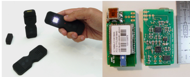
Figure 1: left: MO interface, right MO nano interface.

The MO nano is a bare and smaller version of the MO atom, without any push buttons or LEDs for visualization.