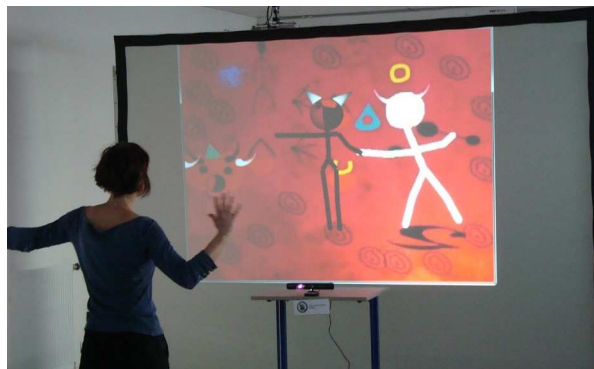
Fig. 1. Scene installation: When the user is detected, the devil-like character “jumps out” of the painting leaving a white empty shape, and the interaction starts

module built in Unity3D. It uses the body coordinates and inverse kinematics to make the virtual agent strictly imitate/follow the user’s movements. A Wizard of Oz (WOZ) technique allows an agent to create new movements during the interaction. The WOZ, managed by one of the evaluators through keyboard controls, can change the agent’s hands directions. No blending issues between old and new movements were perceivable since changes were quite slow. When the WOZ is disabled, the agent will again start strictly following the user’s movements. To study only body movements and for artistic reasons, one of Joan Miró’s colourful paintings involving a devil-like minimalist character made of black segments, was utilized as the agent (see Fig. 1). Participants interacted with the agent by utilizing one of three scenario conditions: