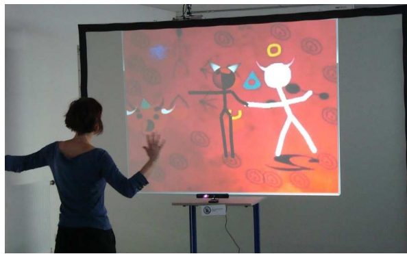
Fig. 1. Scene installation: When the user is detected, the devil-like character “jumps out” of the painting leaving a white empty shape, and the interaction starts

module built in Unity3D. It uses the body coordinates and inverse kinematics to make the virtual agent strictly imitate/follow the user’s movements. A Wizard of Oz (WOZ) technique allows an agent to create new movements during the interaction. The WOZ, managed by one of the evaluators through keyboard controls, can change the agent’s hands directions. No blending issues between old and new movements were perceivable since changes were quite slow. When the WOZ is disabled, the agent will again start strictly following the user’s movements. To study only body movements and for artistic reasons, one of Joan Miró’s colourful paintings involving a devil-like minimalist character made of black segments, was utilized as the agent (see Fig. 1). Participants interacted with the agent by utilizing one of three scenario conditions: