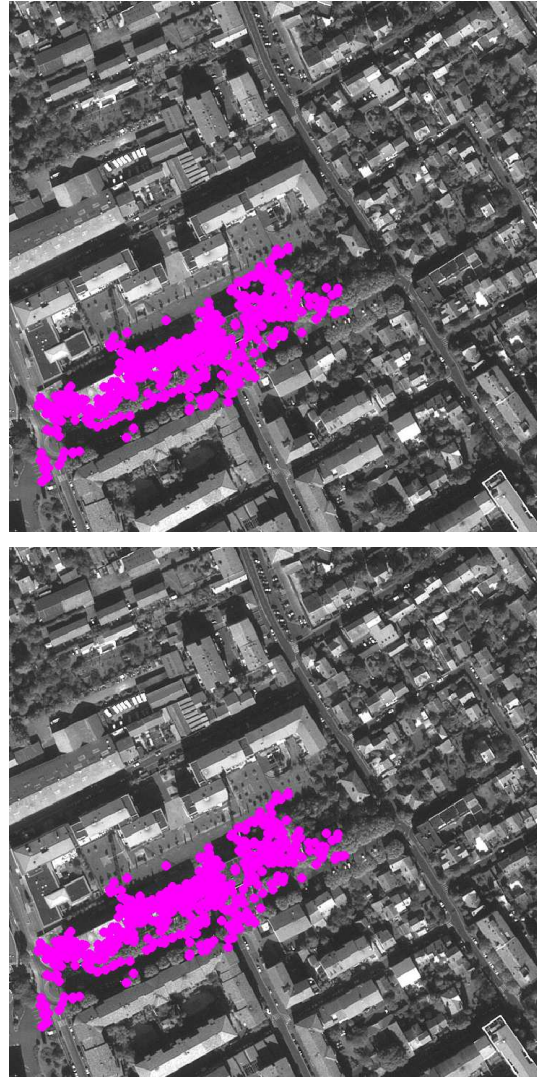
Fig. 4. Keypoints classified as change (example of Fig. 1).