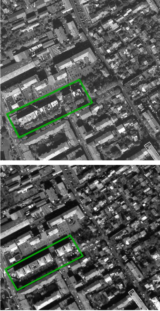
Fig. 1. Example of a pair of optical satellite images, with an apparent change surrounded in green (construction of a building). Both images have a resolution of 50cm and an incidence angle close to nadir, but they have been acquired by different sensors (Geoeye and Worldview).