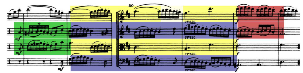
Figure 3. Haydn, op. 33 no. 6, m. 28-33. The truth contains four parallel moves.

356 of the 434 computed synchronized layers are overlapping the p/o/u layers of the truth, thus 82.0% of the computed synchronized layers are (at least partially) musically relevant. These 356 layers map to 194 p/o/u layers in the truth (among 340, that is a sensitivity of 58.0%): a majority of the parallel moves described in the truth are found by the algorithm.