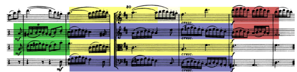
Figure 3. Haydn, op. 33 no. 6, m. 28-33. The truth contains four parallel moves.

356 of the 434 computed synchronized layers are overlapping the p/o/u layers of the truth, thus 82.0% of the computed synchronized layers are (at least partially) musically relevant. These 356 layers map to 194 p/o/u layers in the truth (among 340, that is a sensitivity of 58.0%): a majority of the parallel moves described in the truth are found by the algorithm.