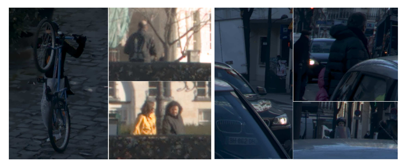
Figure 8: Real data. Extracts of the results obtained by the proposed non local estimation method for moving objects present on the scenes of Figures 6 (left) and Figure 7 (right). Notice that no ghosting artifacts appear in neither example.

Figure 7: Real data. Dynamic scene (pedestrians in the street and moving cars) acquired using a hand-held camera. Left : Tone mapped irradiance estimation using the proposed non local approach. No ghosting artifacts appear. Right first row: Input images (JPEG version). Right second row: Extracts of the normalized reference image. Right third row: Extracts of the results by Sen et al. [26]. Right fourth row: Extracts of the results by the proposed non local approach. The result obtained by the proposed approach is significantly less noisy than the one by Sen et al. Please see the electronic copy for better color and details reproduction.