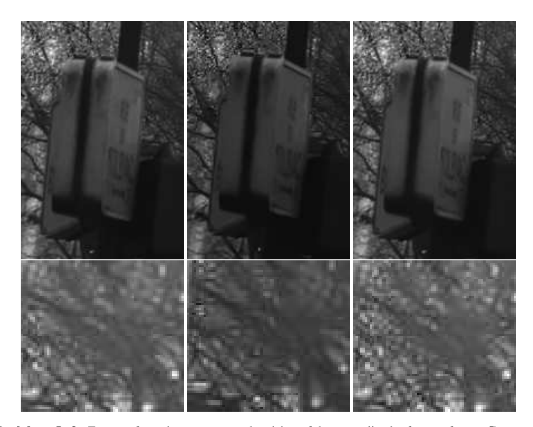
Figure 9: Real data. Left: Extracts from the NL-MEANS denoising of the normalized reference frame. Center: NL-MEANS denoising of the result by Sen et al. Right: Proposed non local approach. The proposed approach manages to better denoise the bright regions (see the street panel) while better preserving details on dark regions (see the tree branches). On the contrary, this is not the case for the two other examples. The denoising technique manages to remove part of the noise on the bright regions but at the cost of blurring the dark zones. Only the green channel irradiance is displayed in order to avoid contrast changes introduced by the tone mapping techniques (needed to display HDR color images) and better visualize noise level differences.