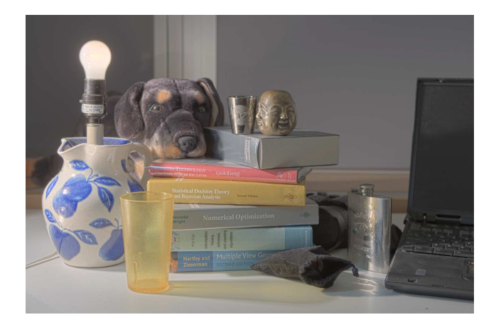
Figure 2: Tone mapped version of the HDR image used as ground-truth for the synthetic test presented in Section 4.1. From [13].