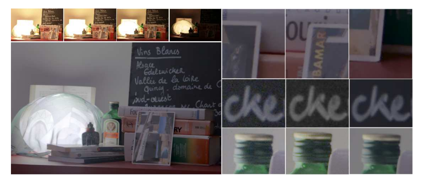
Figure 5: Real data. Static scene except for one moving object (the postcard) acquired using a hand-held camera. Left side. First row: Input images (JPEG version). Second row: Tone mapped irradiance estimation using the proposed non local estimation approach. Right side. First row: Extracts of the moving object (the postcard). No ghosting artifacts appear. Second / Third row: Extracts of the normalized reference image (left), the method by Sen et al. [26] (center) and the proposed non local approach (right). The irradiance estimation of the proposed approach is considerably less noisy than the one obtained using the reference frame only or the method by Sen et al. Please see the electronic copy for better color and details reproduction.

ing technique manages to remove part of the noise on the bright regions but at the cost of blurring the dark zones.