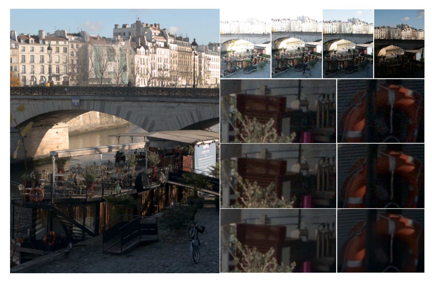
Figure 6: Real data. Dynamic scene (pedestrians in the bridge and people next to the boat) acquired using a hand-held camera. Left: Tone mapped irradiance estimation using the proposed non local approach. No ghosting artifacts appear. Right first row: Input images (JPEG version). Right second row: Extracts of the the normalized reference image. Right third row: Extracts of the results by Sen et al. [26]. Right fourth row: Extracts of the results by the proposed non local approach. The result obtained by the proposed approach is far less noisy than the one by Sen et al. Please see the electronic copy for better color and details reproduction.