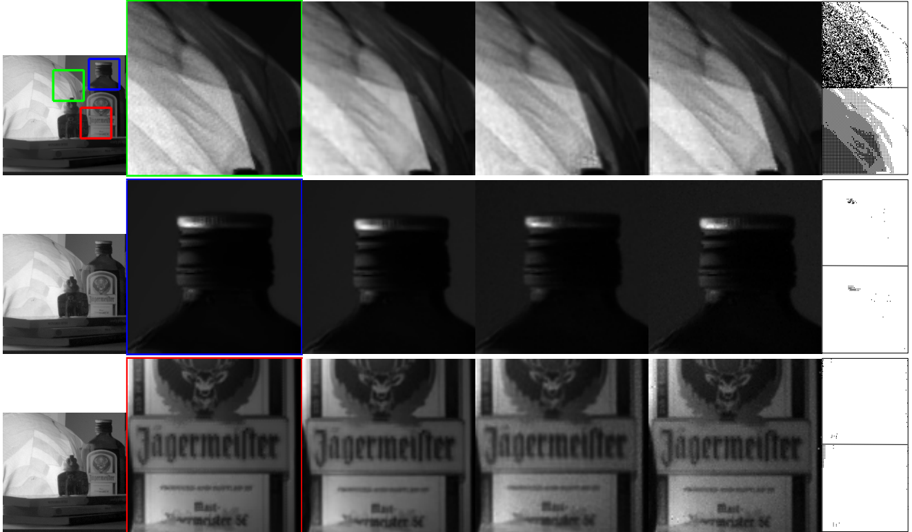
Figure 3: Synthetic data. First column (top to bottom): Ground-truth with indicated extracts, full image result obtained by the proposed approach, full image result by Schöberl et al. [15] Second to fifth column (left to right): Extracts of the ground-truth, result by the proposed approach, Schöberl et al. [15], Nayar and Mitsunaga [12]. Sixth column: Random (top) and regular (bottom) mask for each extract. Black represents unknown and white known pixels. The percentage of unknown pixels for the first extract is 65% (it is nearly the same for both the regular and non-regular pattern). For the other two extract most pixels are known (99%) so that the proposed method mostly performs denoising in these extracts.