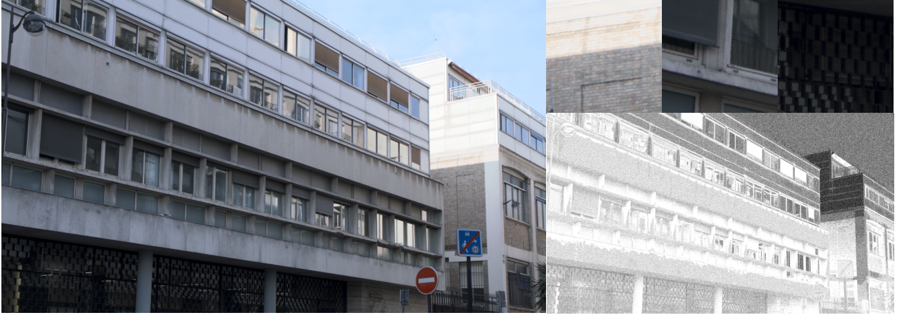
Figure 6: Real data. Left: Tone mapped HDR image obtained by the proposed approach (15.6 stops). Right top: Extracts of the scene. Right bottom: Mask of unknown (black) and known (white) pixels. In the brightest part of the building 73% of the pixels are unknown. Despite this fact, the reconstructed HDR image does not exhibit any visible artifact.