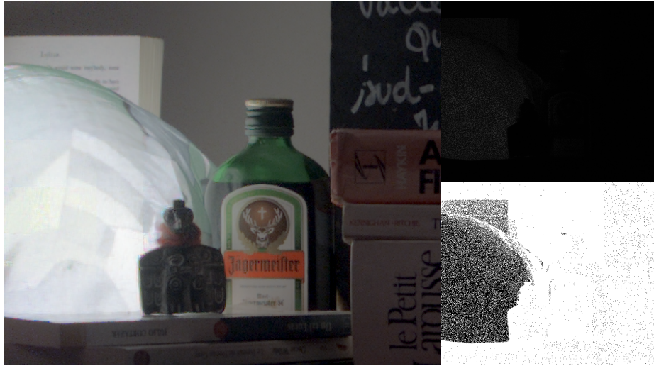
Figure 7: Real data. Left: Tone mapped HDR image obtained by the proposed approach (13.4 stops). Right top: Raw image with spatially varying exposure levels. Right bottom: Mask of unknown (black) and known (white) pixels. In the lamp area 70% percent of the pixels are unknown.

since \mathbf{w}_q is independent of \mathbf{f}_p and has zero mean. From the patch model (5), the (p, q) element of matrix \mathbb{E}[\mathbf{y}\mathbf{y}^T] is given by