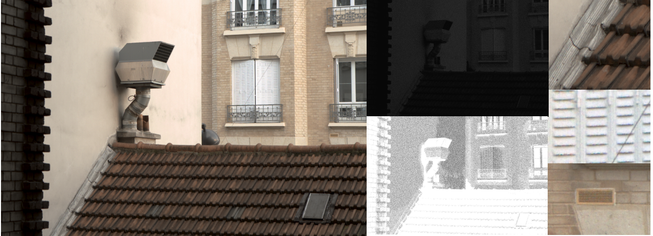
Figure 5: Real data. Left: Tone mapped HDR image obtained by the proposed approach (11.4 stops). Middle top: Raw image with spatially varying exposure levels. Middle bottom: Mask of unknown (black) and known (white) pixels. In the regions with unknown pixels, the percentage of missing pixels varies between 25% to 40%. Right: Extracts of the scene

rectly reconstructed (please consult the pdf version of this article for better visualization).