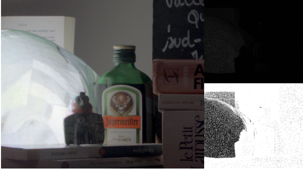
Figure 1: Example of the acquisition of an HDR scene using spatially varying pixel exposures. Left: Tone mapped HDR scene restored from the raw image. Right top: Raw image with spatially varying exposure levels. Right bottom: Mask of correctly exposed pixels (white) and under or over exposed pixels (black).

A problem encountered by this approach is the need for inpainting saturated and underexposed regions in the reference frame, since the information is completely lost in those areas. The SVE acquisition strategy prevents from having large saturated regions to inpaint. In general, all scene regions are sampled by at least one of the exposures thus simplifying the inpainting problem.