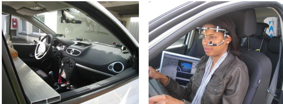
Fig. 3: Views of the CEREMA's instrumented vehicle (and instrumented driver).

their determination has to be made mostly manually. Another difficulty is that various information may be present in the same AOI at the same time. For instance, the use of AOI to understand which information is used in curve driving (tangent point versus point on the future path) may not be relevant, because the AOIs of the tangent point and future path may frequently overlap (Lappi, Pekkanen, and Itkonen, 2013).