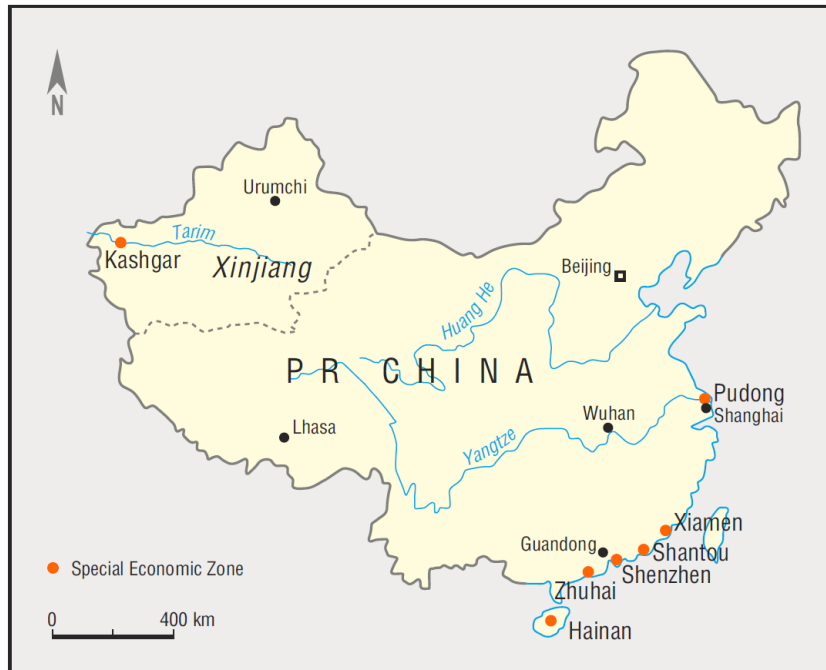
Figure 3: Kashgar as latest member of China's Special Economic Zones Source: Design Hermann Kreutzmann 2013

Kashgar is a prominent case in point that has got more attention than others. Thus, the oasis towns have found an exceptional position within the context of modernisation. What happened to the pastoral hinterland? Since the beginning of the 21 st century the resettlement programme within the 'Great Development of the West' campaign ( xibu da kaifa ) is the expression of linking both entities the compact and the scattered or the urban and the rural. Resettlement leads to bringing modernisation to the periphery and is at the same time fostering rural-urban migration. 75 The implementation of a full-flung special economic zone is only at its beginning, the pace is significant; thus, the transformation process might even speed up further. The vision is to transform this urban oasis into a prosperous international trading centre where welfare for the majority population and accessible modern lifestyle will suppress and/or replace popular unrest and expressions of ethnicity that have frequently led to severe confrontation. Whether this experiment will bear fruits needs to be awaited.